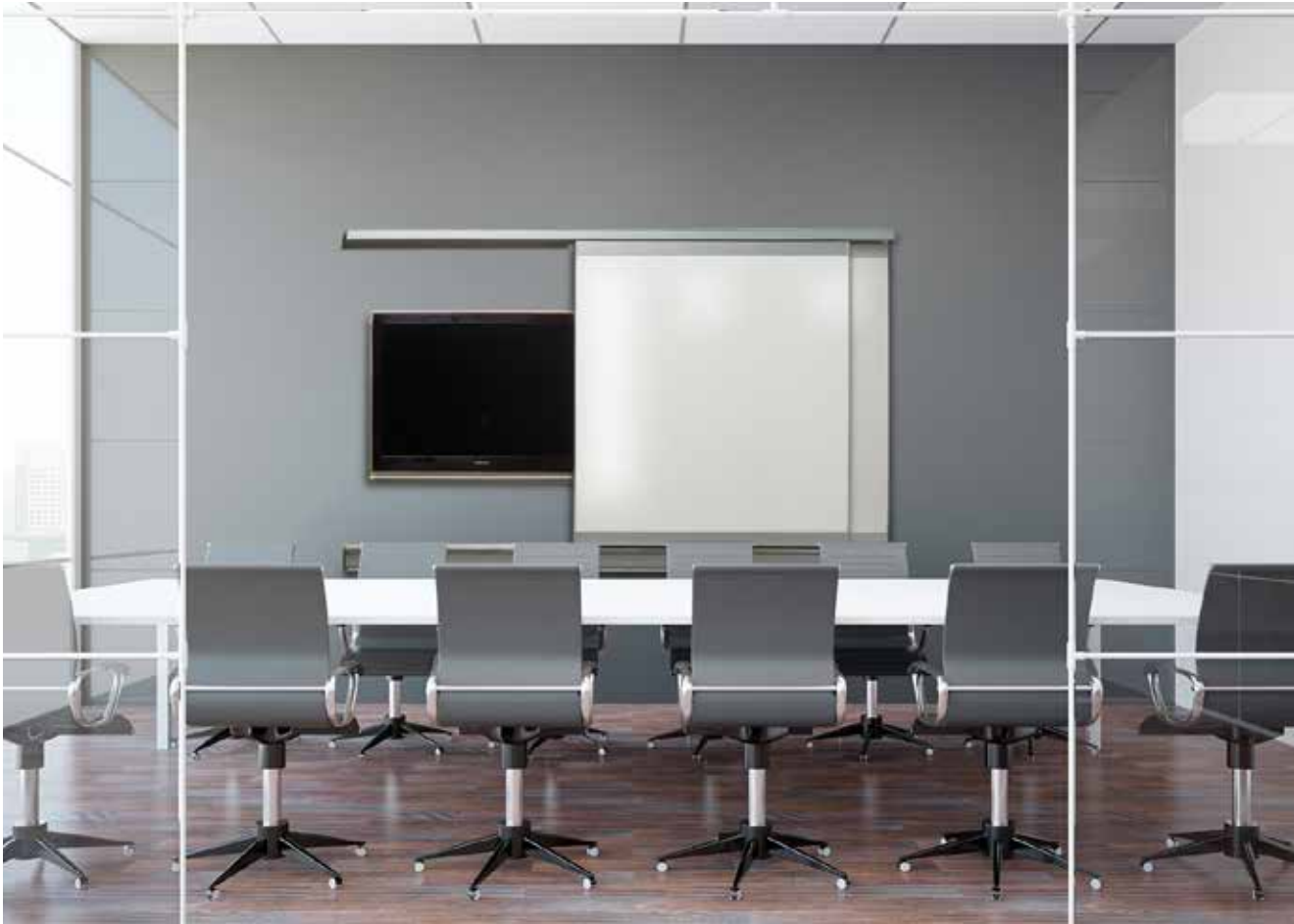
VIP+ Media Wall backpainted Corona White Glass Markerboards