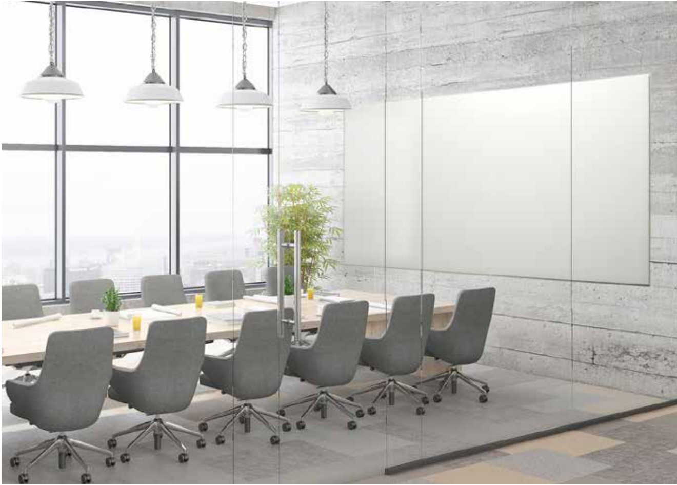
Frameless Glassboards in Satin non-glare glass.