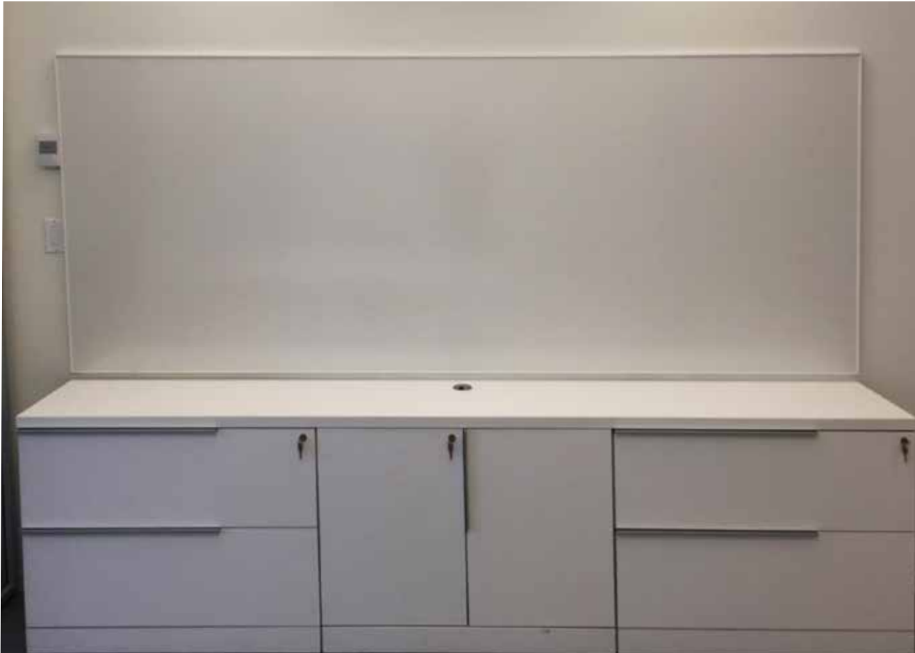
elements Series Custom Sized Porcelain Makerboards in white powder coat frame.