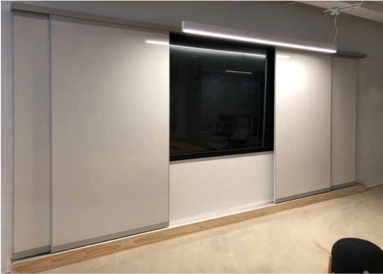
VIP+ Media Walls in CPS Porcelain.