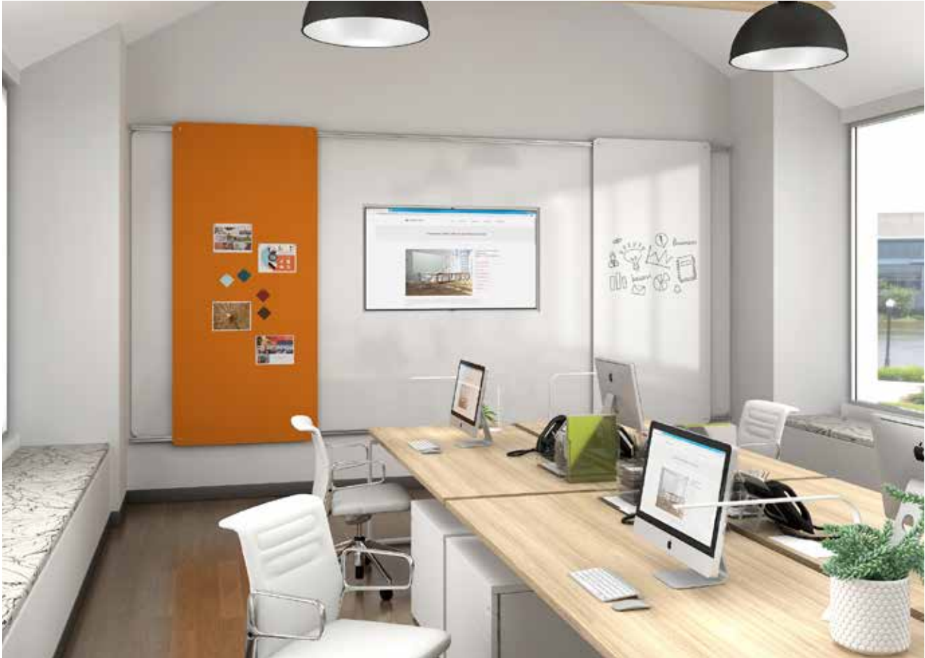
Merge Rail-frameless Sliding Porcelain Media Wall with reversible Acousticator/Porcelain Panels.