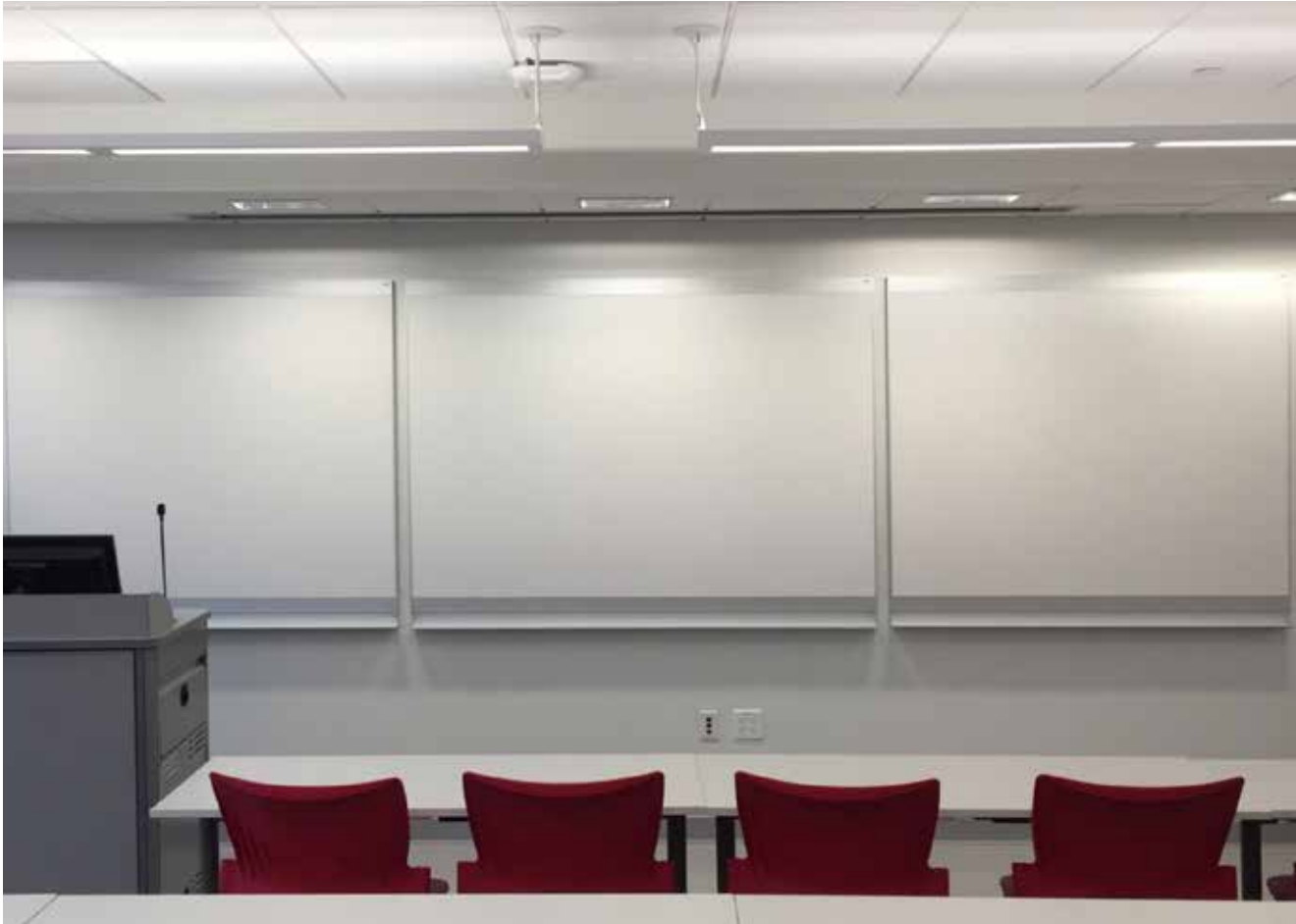
VIP Framed Porcelain Markerboards with Integrated Universal Penshelf.