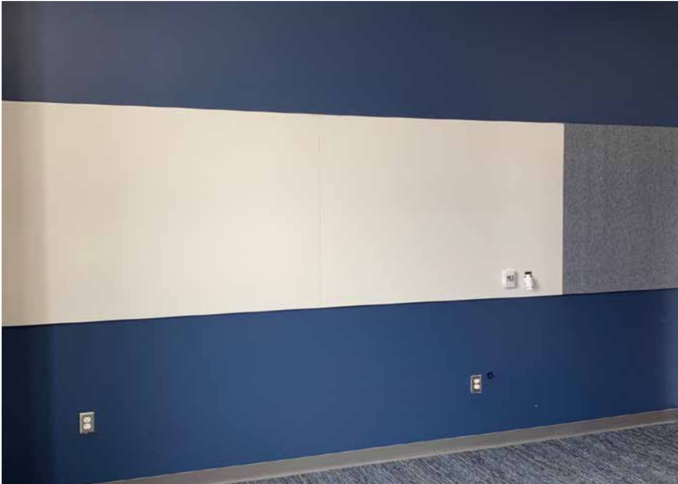
Merge Frameless Porcelain Combiboards, CPS Porcelain, spline joint and Acousticolor panel.