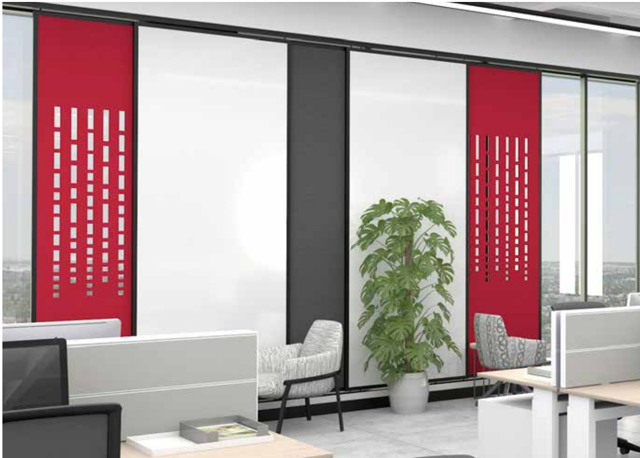
Intersection Slide Wall Mounted Sliding Panels with Integrated Acoustic Panels in custom colors and cutout patterns.