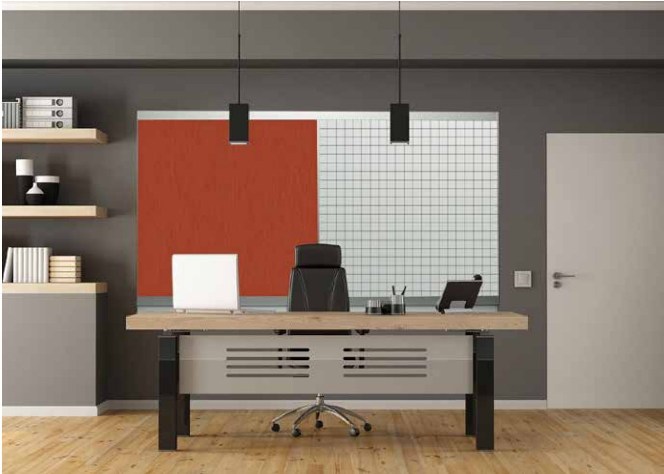
VIP Framed Glass Combiboard backpainted with Corona White Glass, printed graphic grid and tackable fabric.