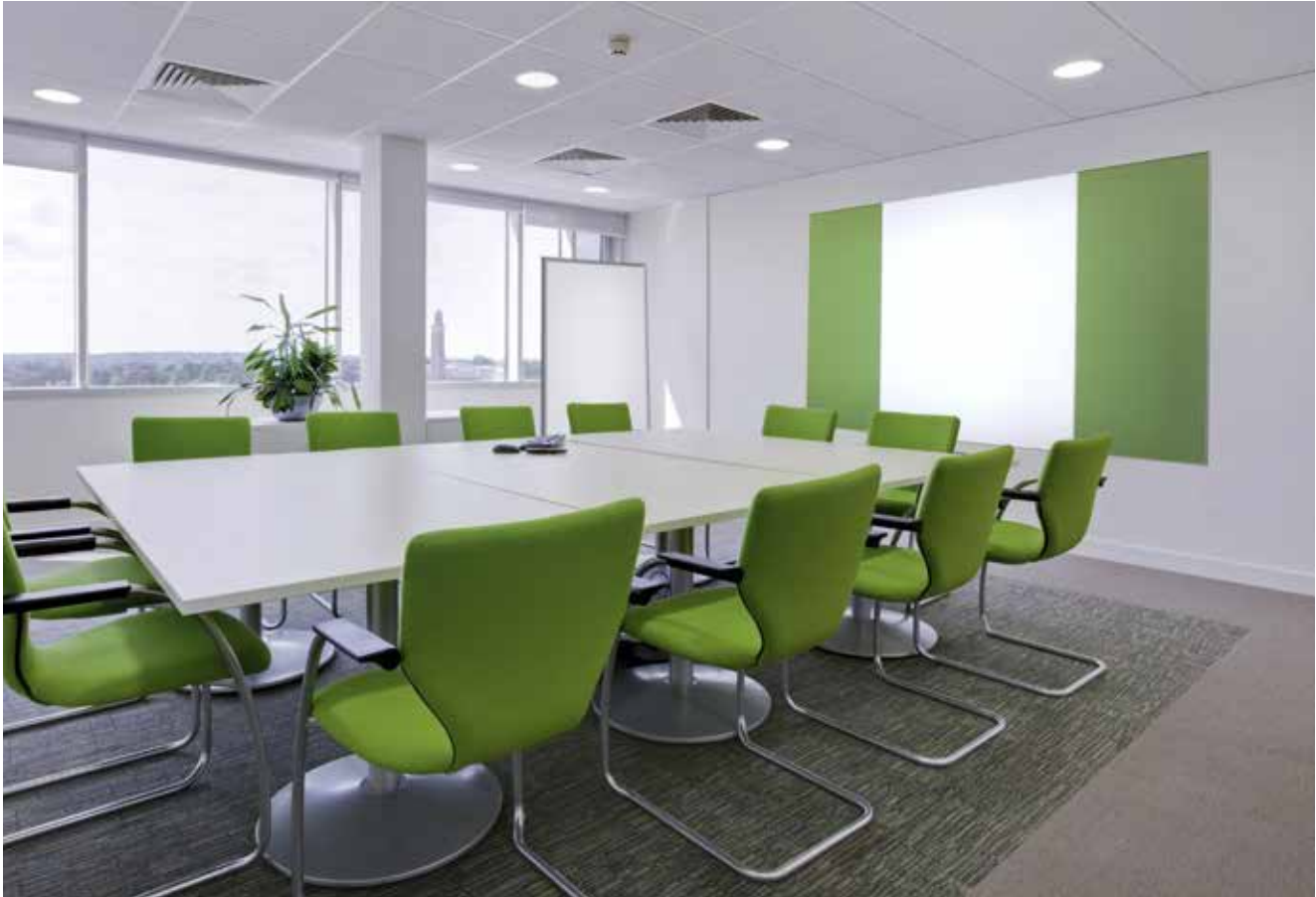
elements Series Combiboard integrated with tackable fabric.