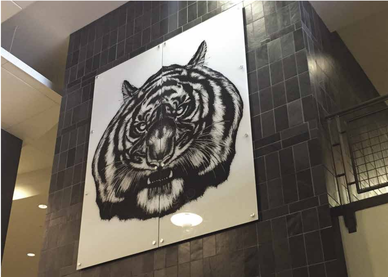
Custom graphics make the glassboard a design element for any environment. Mounted here with standoffs.