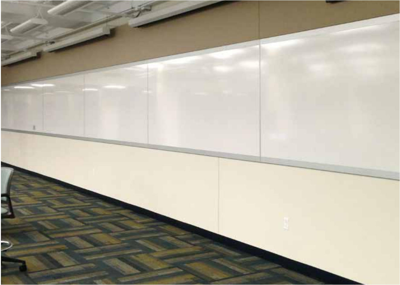
VIP Series Framed Markerboards with H-Profile Connections for a seamless wall of porcelain.