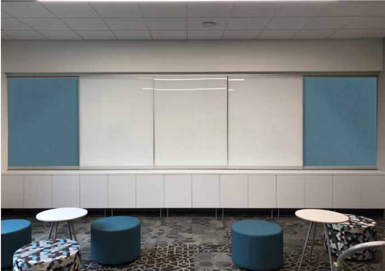
VIP+ Framed Sliding Glass Markerboards backpainted in Corona White with Custom Fabric Component Boards.