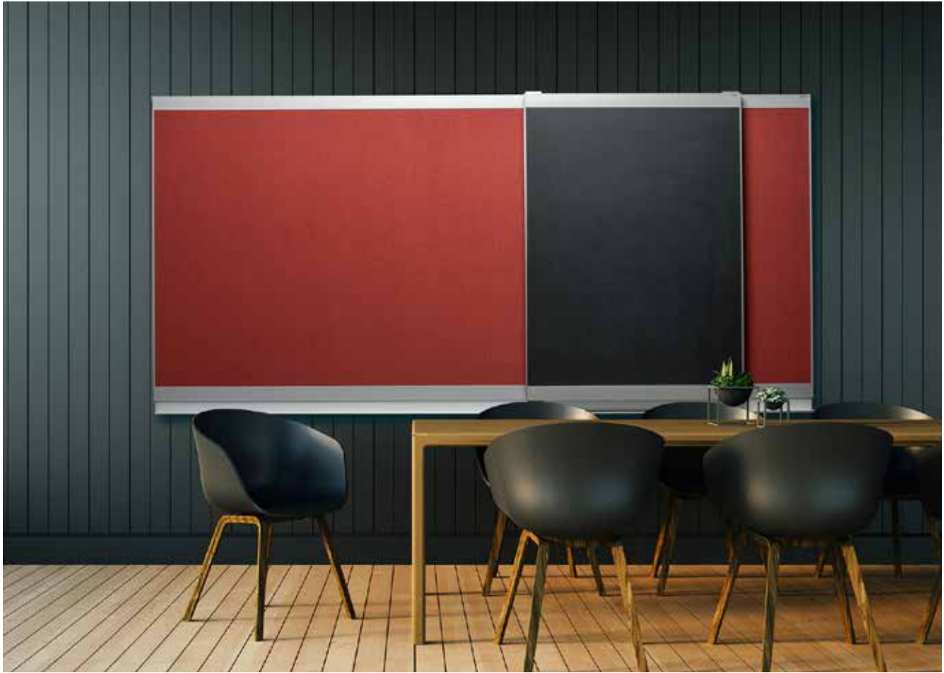
VIP Notice Board with Tackable Fabric shown with VIP Porcelain Chalk Component Boards.