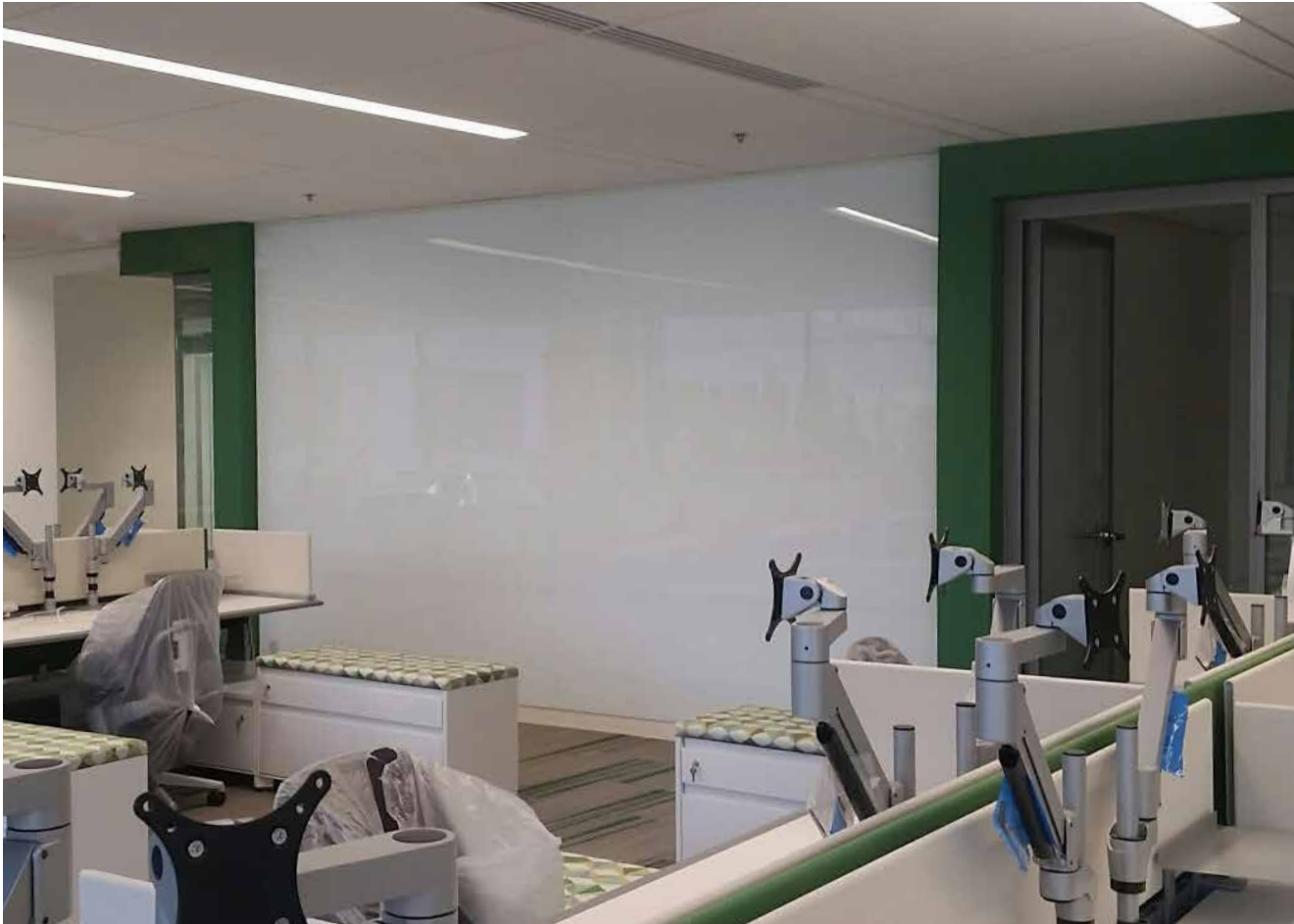
Frameless Magnetic Glass Markerboards backpainted with Corona White.