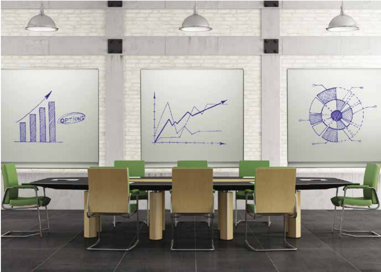
elements Series framed glassboards in Classic Starphire.