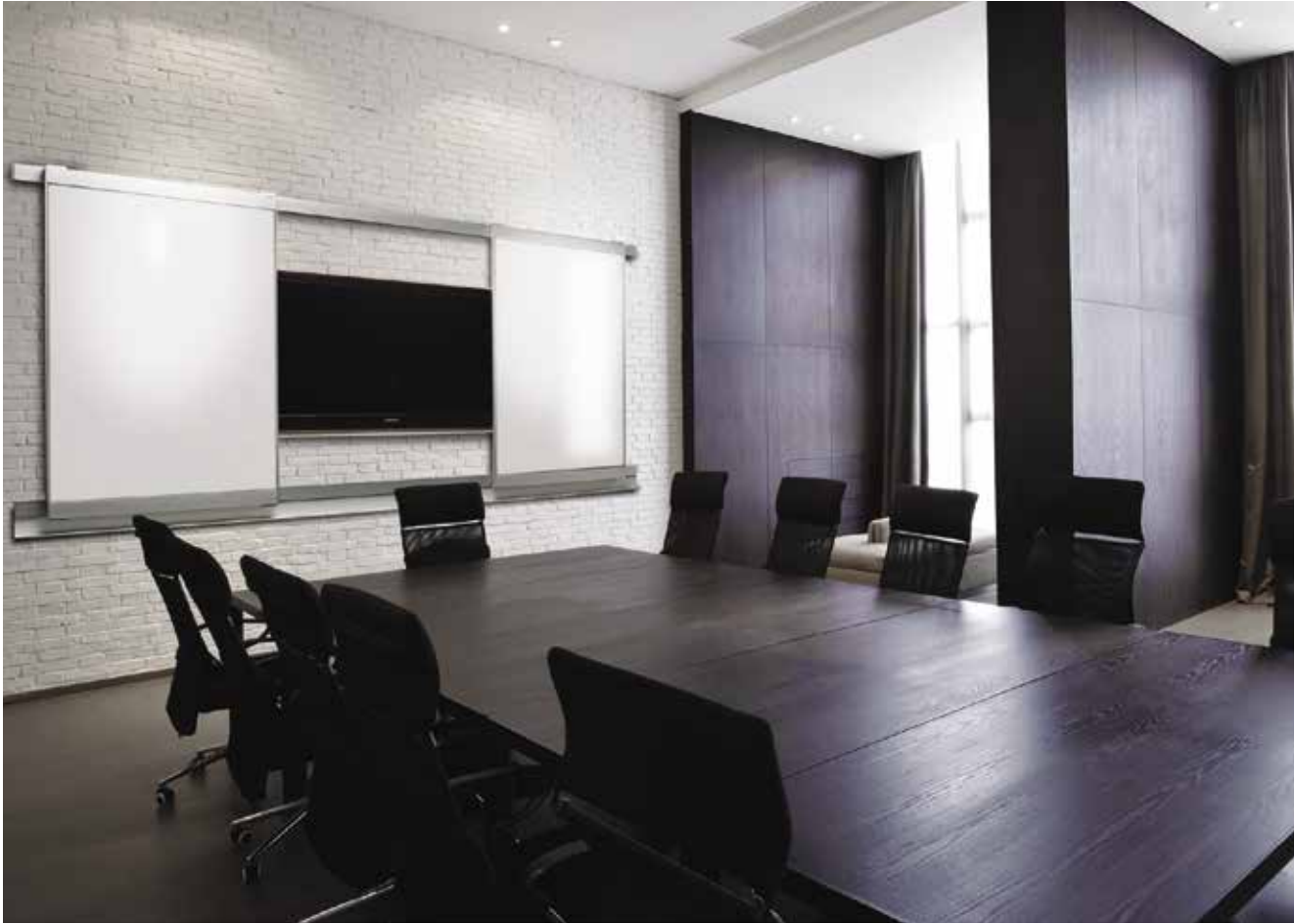
VIP Series Media Wall—Component Boards in porcelain create elegant presentation walls for both Digital and Analog tools.