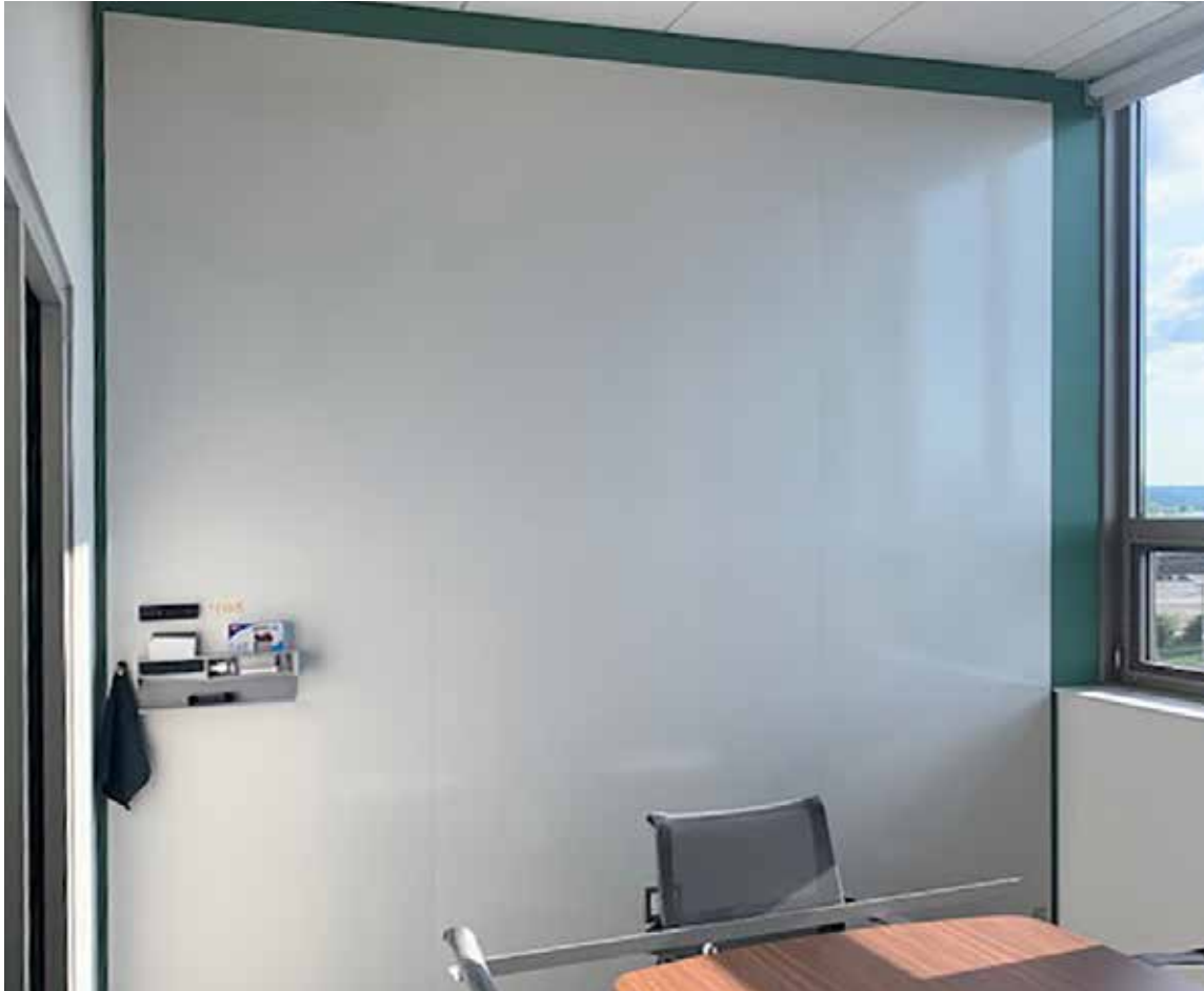
Merge Frameless Porcelain Markerboards with HUB Accessory pack.