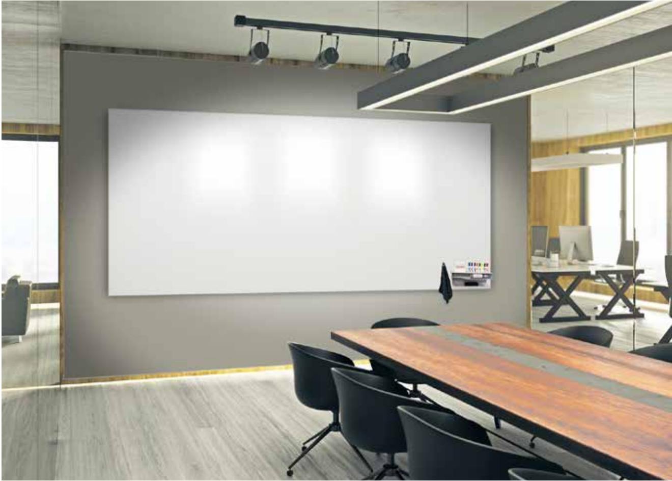
Merge Frameless magnetic porcelain markerboards. Available with square or knife edge.