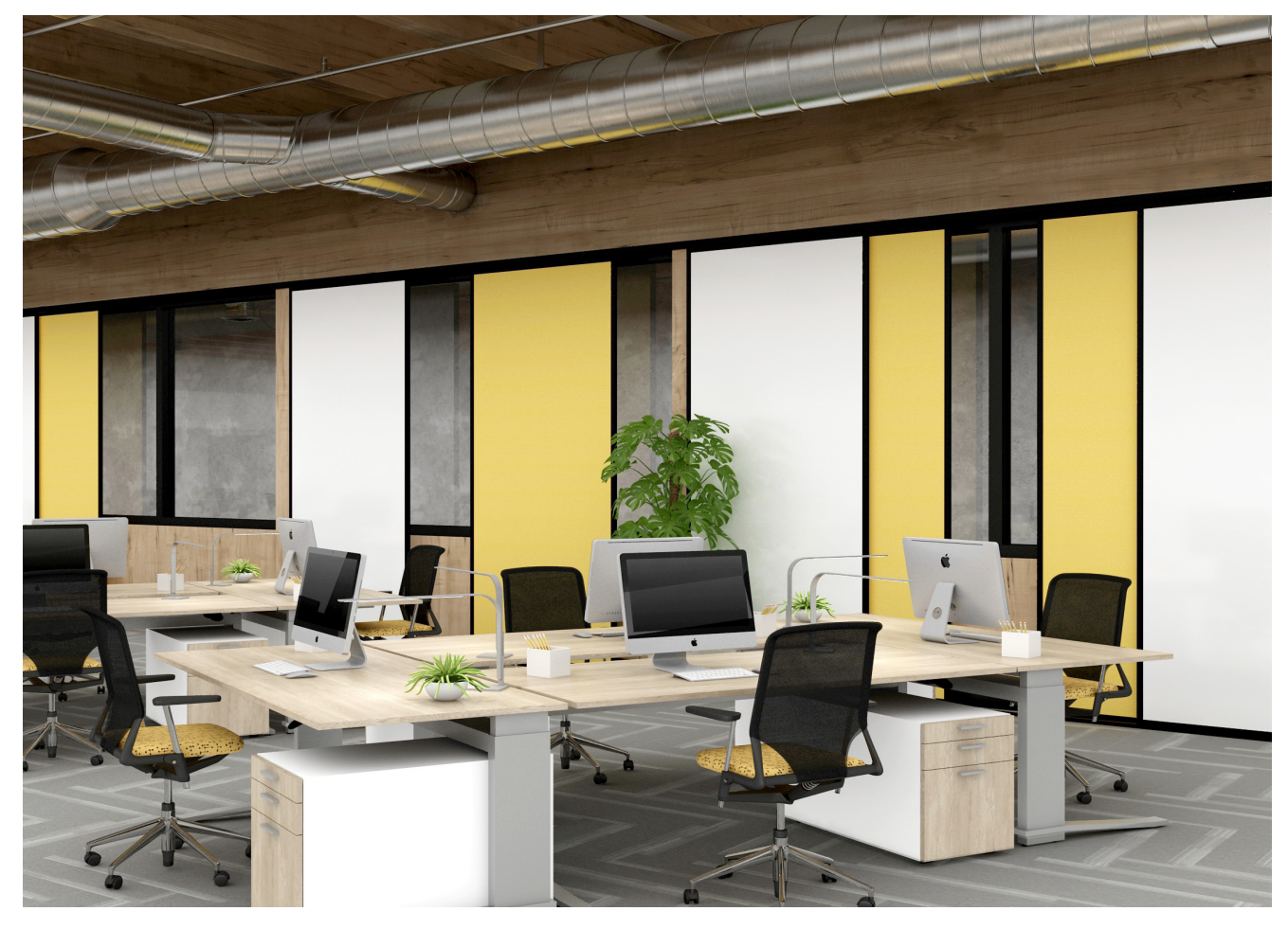
VIP+ Bottom Rolling Sliding Panels with CPS Porcelain and Acousticor in Black Powder Coated Frames.