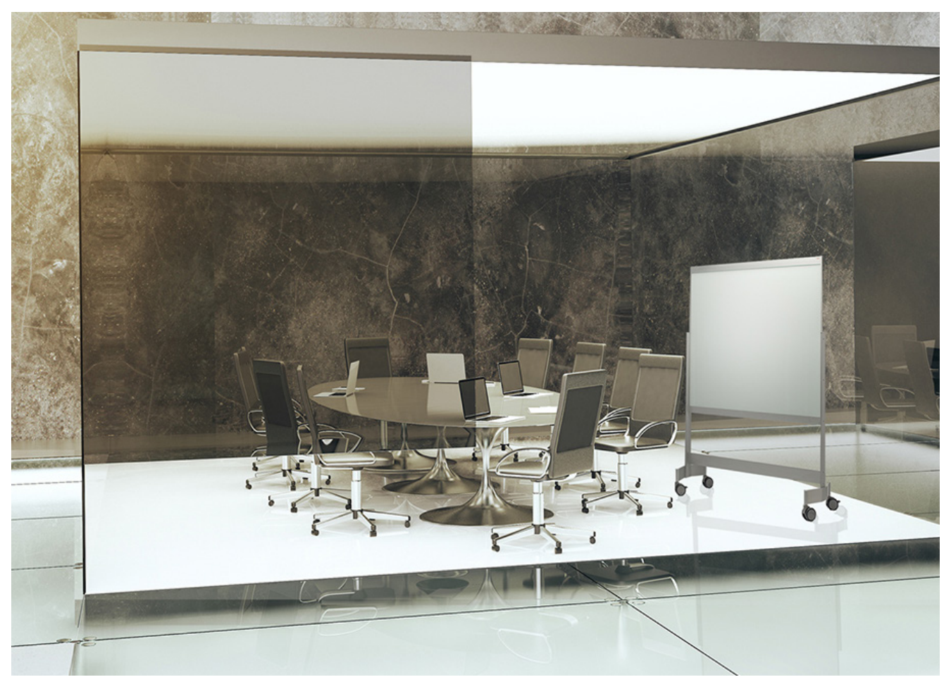
VIP Two-Sided Mobile Magnetic Mobile Glassboard in Classic Starphire Corona White.