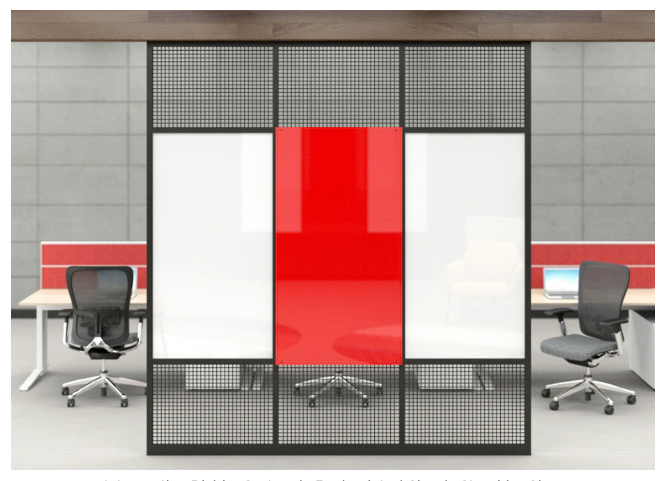
Intersection Divider System in Backpainted Classic Starphire Glass, Mesh inserts and Custom Backpainted Sliding Glassboard in Corona Red.