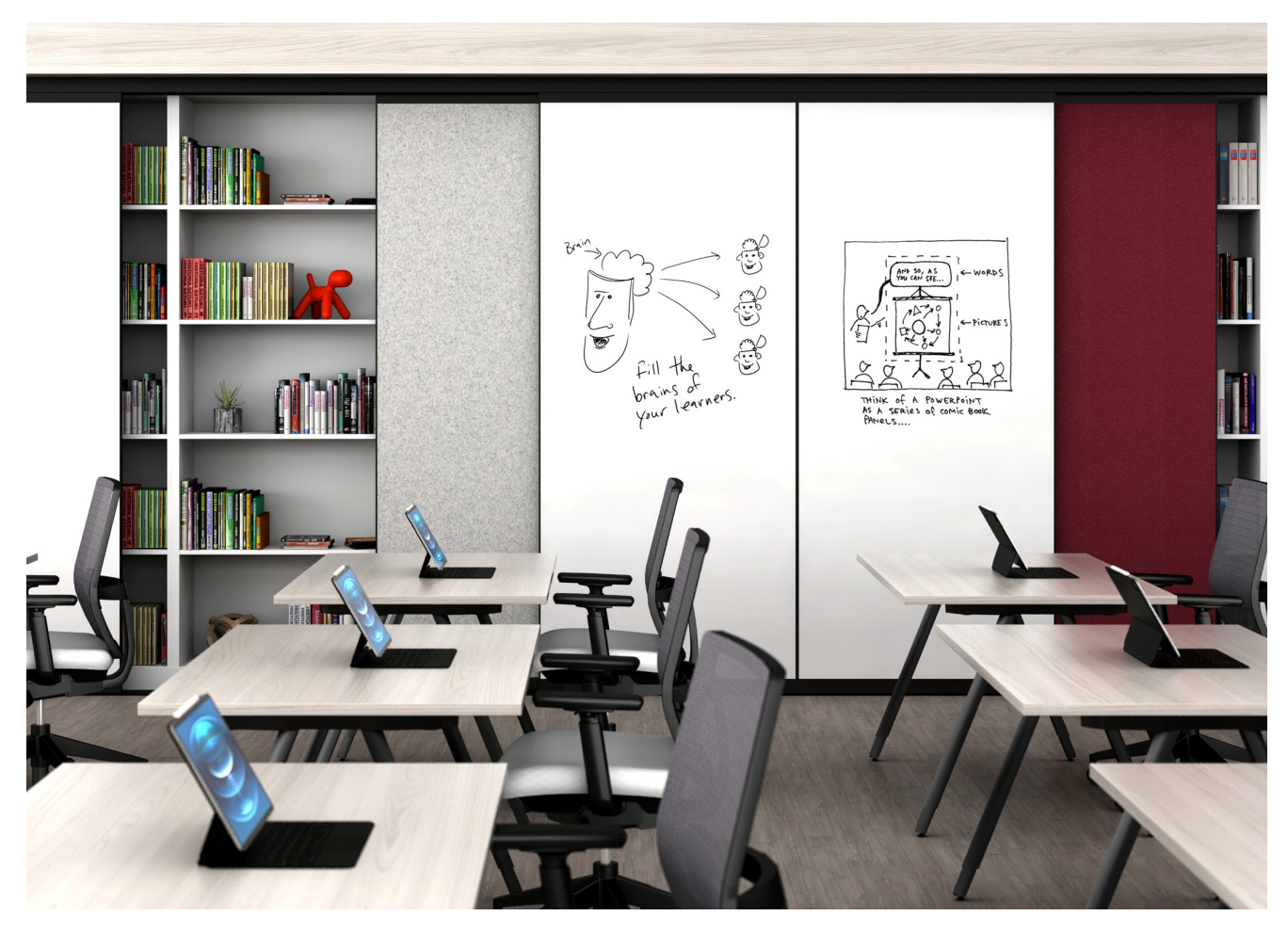
VIP+ Top Hung Sliding Wall Panels in CPS Porcelain Markerboards and Custom Acousticor Panel.