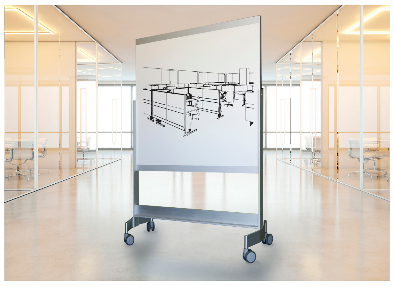
VIP Series Framed Mobile Markerboards in CPS Porcelain.