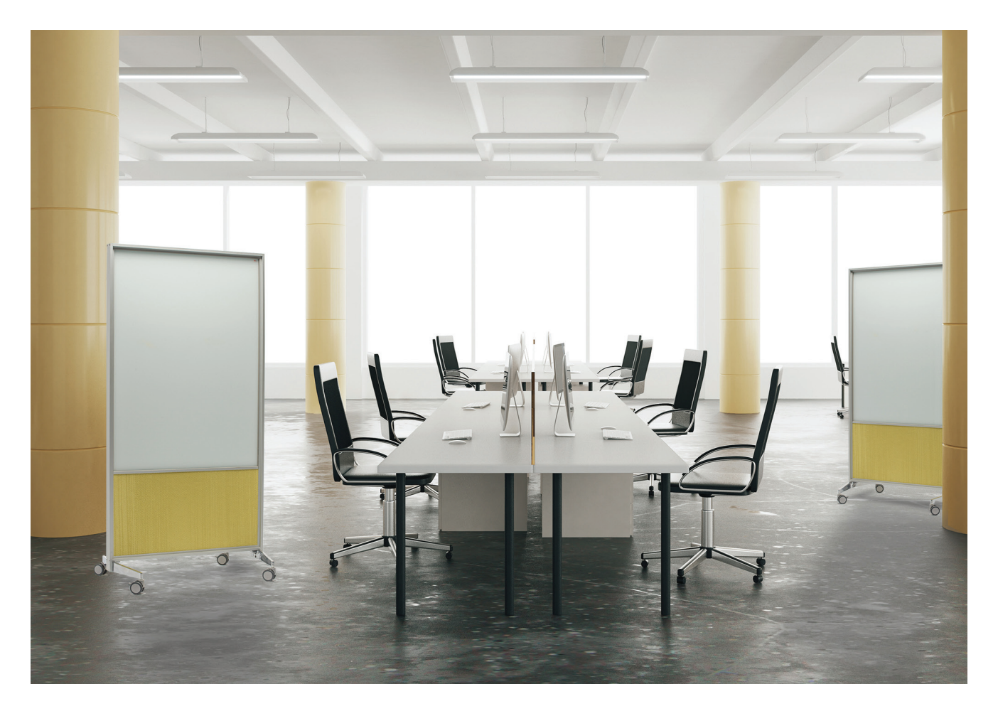
elements Series Mobile Glass Combiboards Backpainted in Corona White and Custom Fabric.