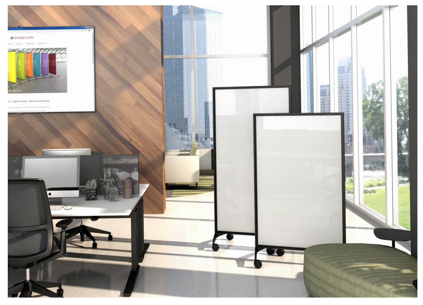
elements Series Mobile CPS Porcelain Makerboards in Black Powder Coated Frames.