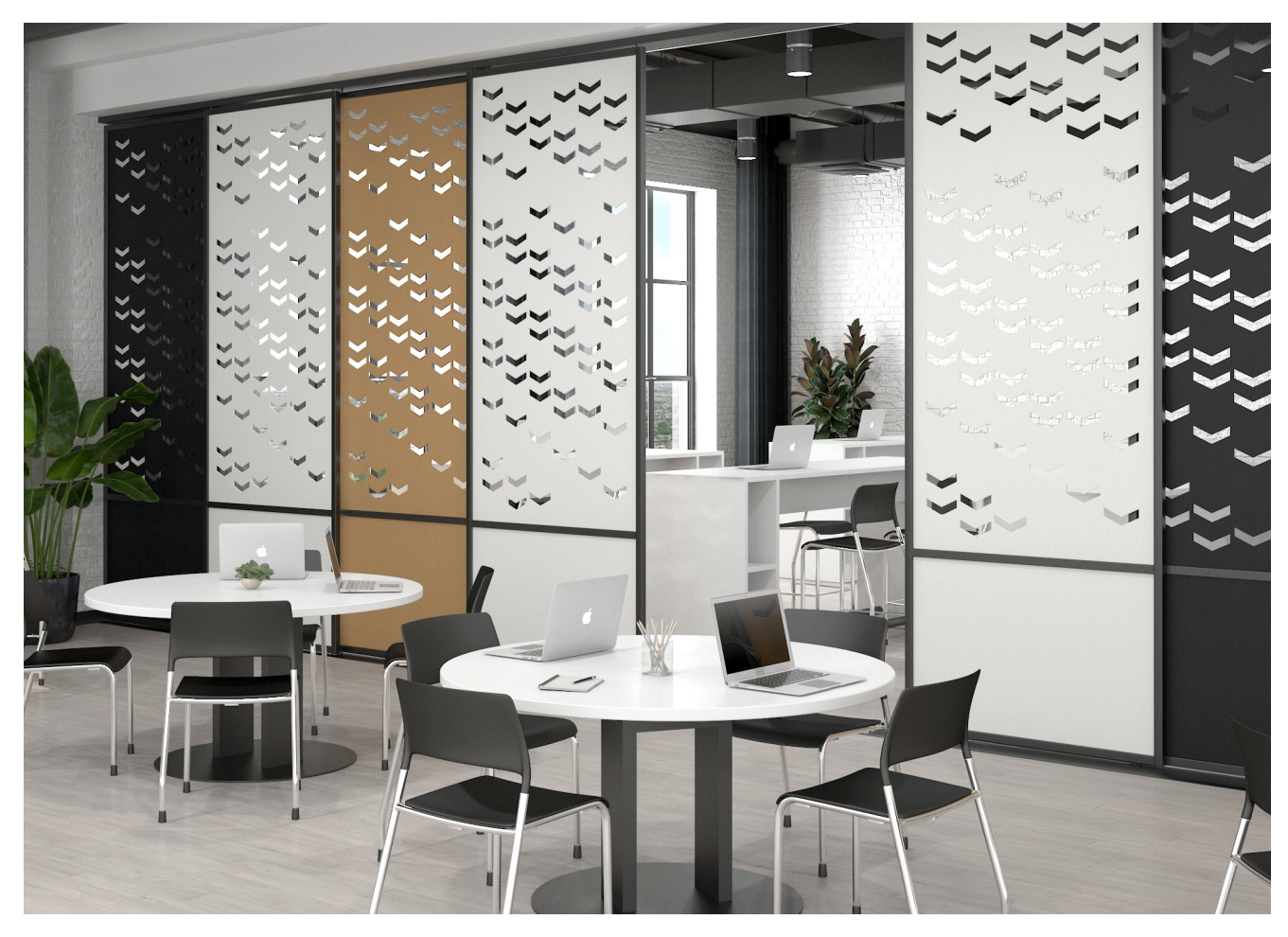
Intersection Slide with Custom Cut-out Acousticor Panels and Black Powder Coated Frames