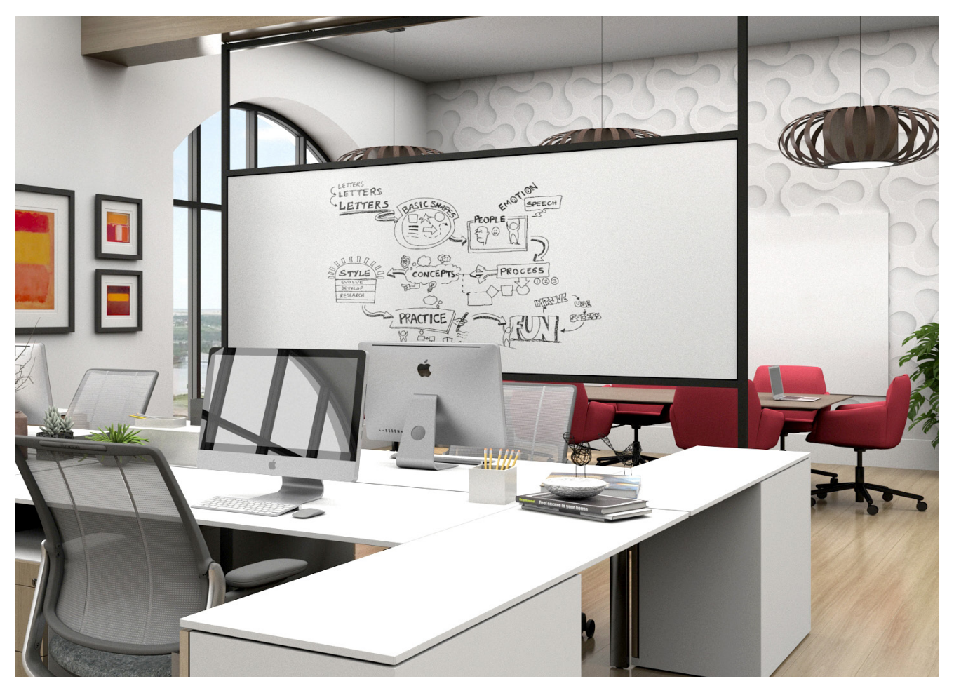
Intersection Divider System with CPS Porcelain Markerboard in Black Powder Coated Frames.