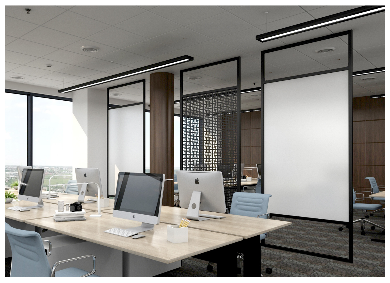
Intersection Divider System in CPS Porcelain Markerboards, Custom Metal Cut-outs and Black Powder Coated Frames.