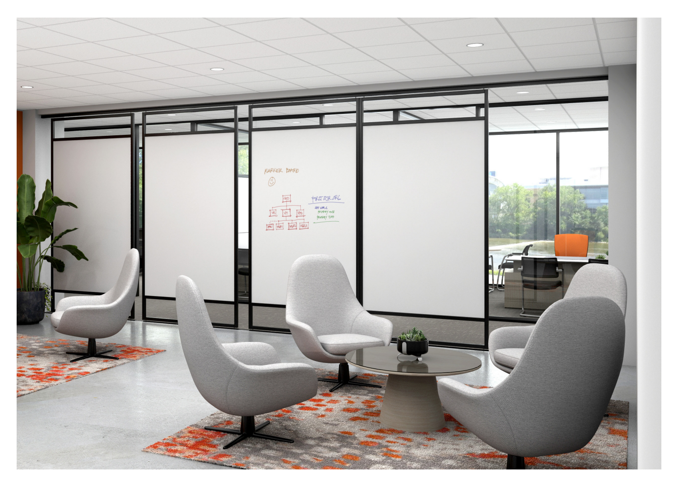
Intersection Slide with CPS Porcelain Markerboards and Custom Wire Mesh Inserts.