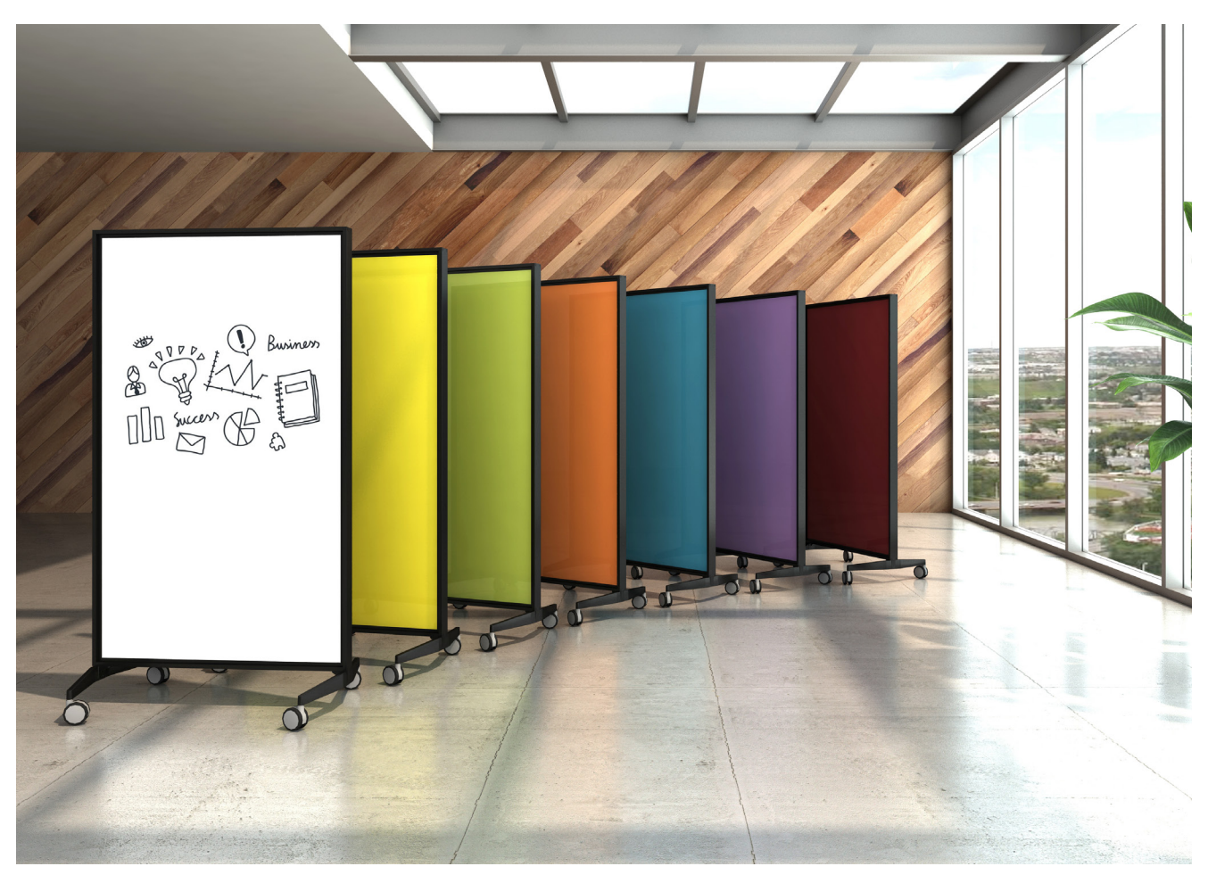
elements Series Mobile Glass Markeboards in almost any color you can imagine.