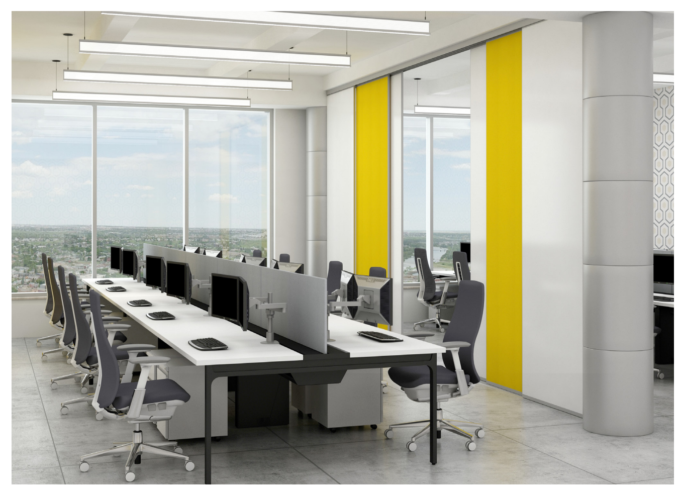
VIP+ Sliding Wall Panel Glass Markerboards in Designer Speicifed Backpainted Color and Corona White.