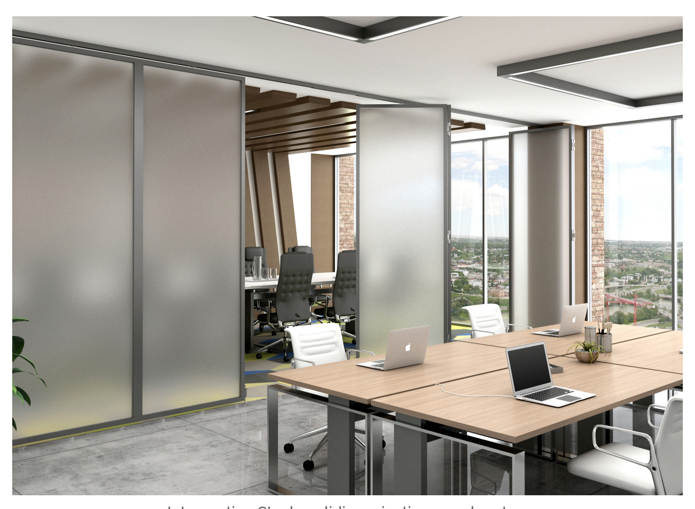
Intersection Stack-a sliding, pivoting panel system, shown here with frosted glass panels. Available in a wide range of panel materials, including porcelain, magnetic glass, fabric and acousticor.