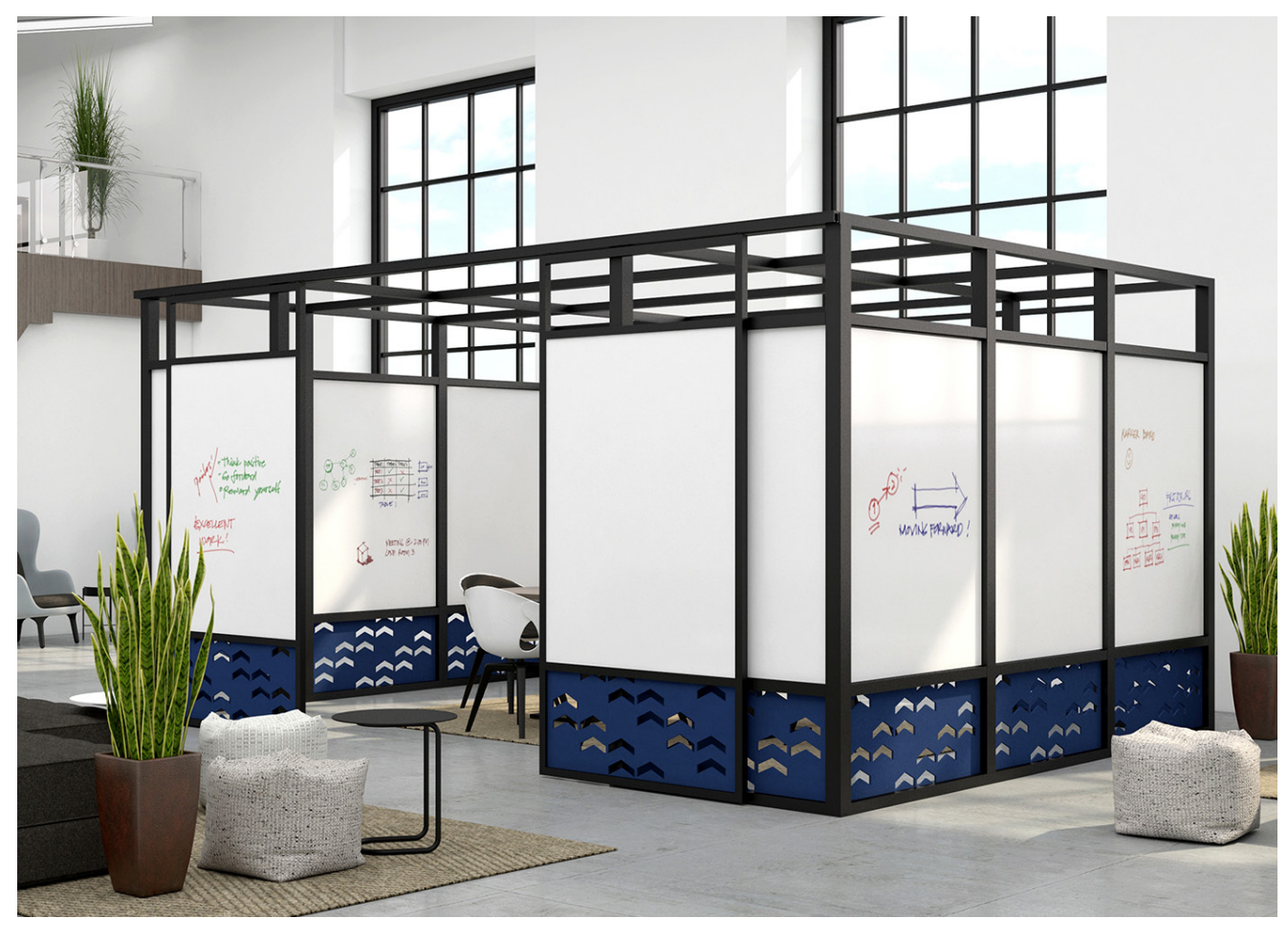
Intersection Space and Intersection Slide with CPS Porcelain Markerboards and Custom Cut-Out Acousticor Panels.