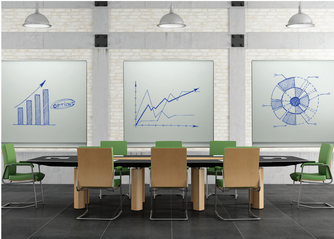
elements Series framed glassboards in Classic Starphire.