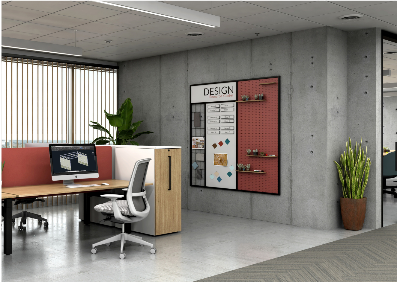
Intersection Message Center with CPS Porcelain Markerboards, Custom Wire Mesh and Custom Designer Specified Color Peg Board.