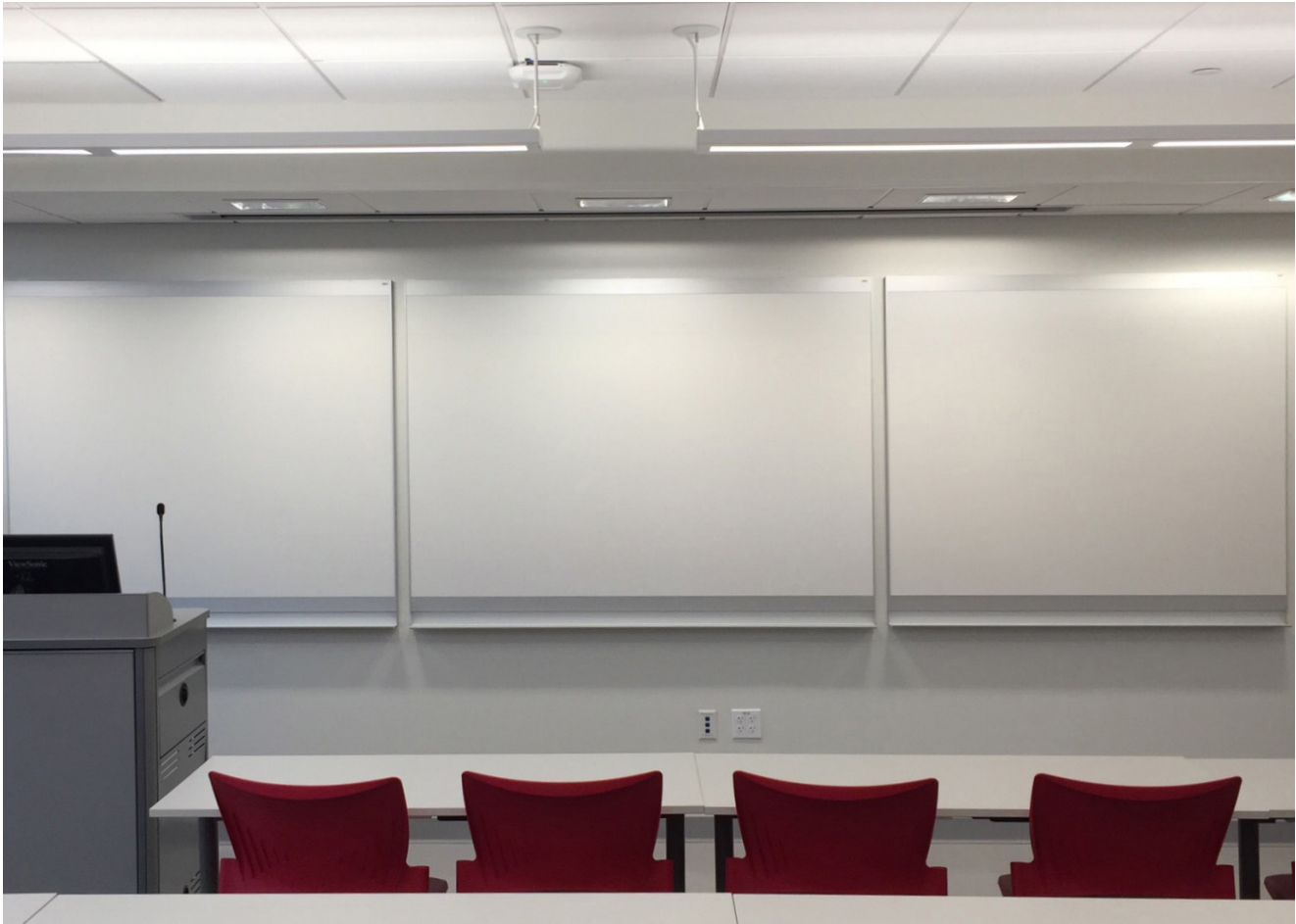
VIP Framed Porcelain Markerboards with Integrated Universal Penshelf.