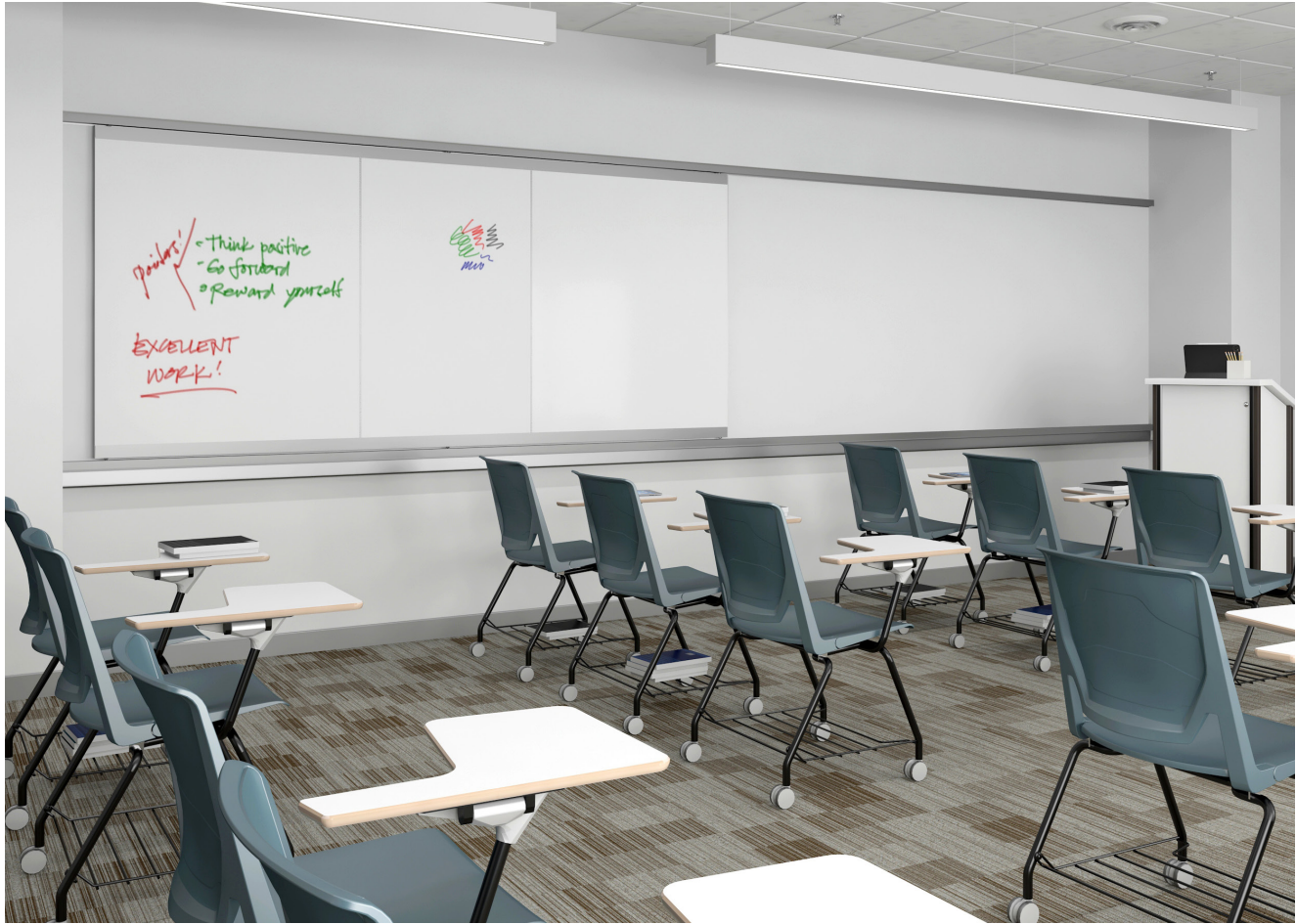
VIP+ Series Sliding Wall Panels with CPS Markerboards and H-Profile Connections.