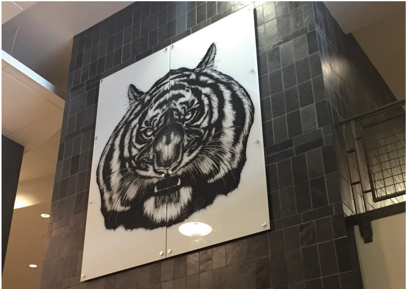
Custom graphics make the glassboard a design element for any environment. Mounted here with standoffs.