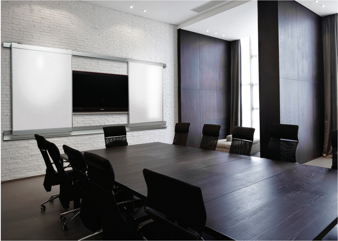
VIP Series Media Wall—Component Boards in porcelain create elegant presentation walls for both Digital and Analog tools.