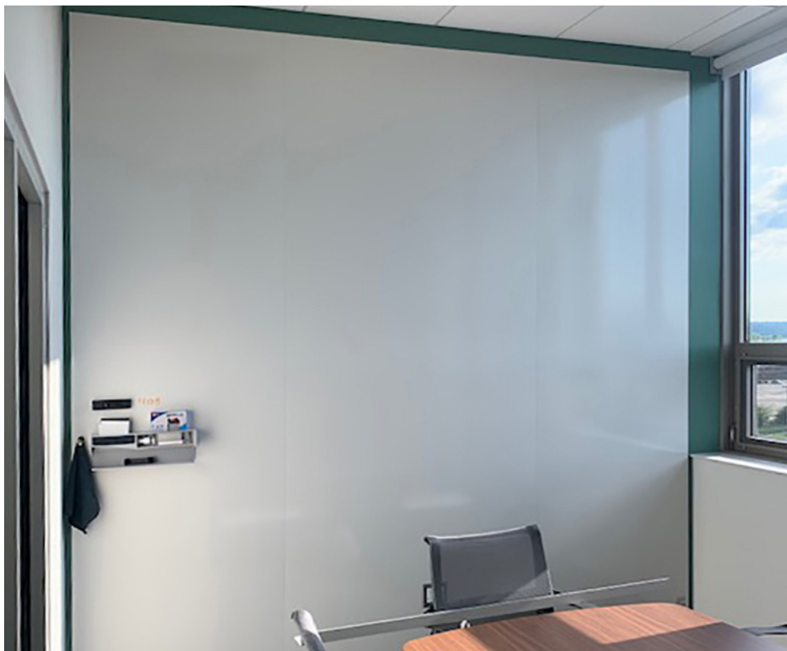
Merge Frameless Porcelain Markerboards with HUB Accessory pack.