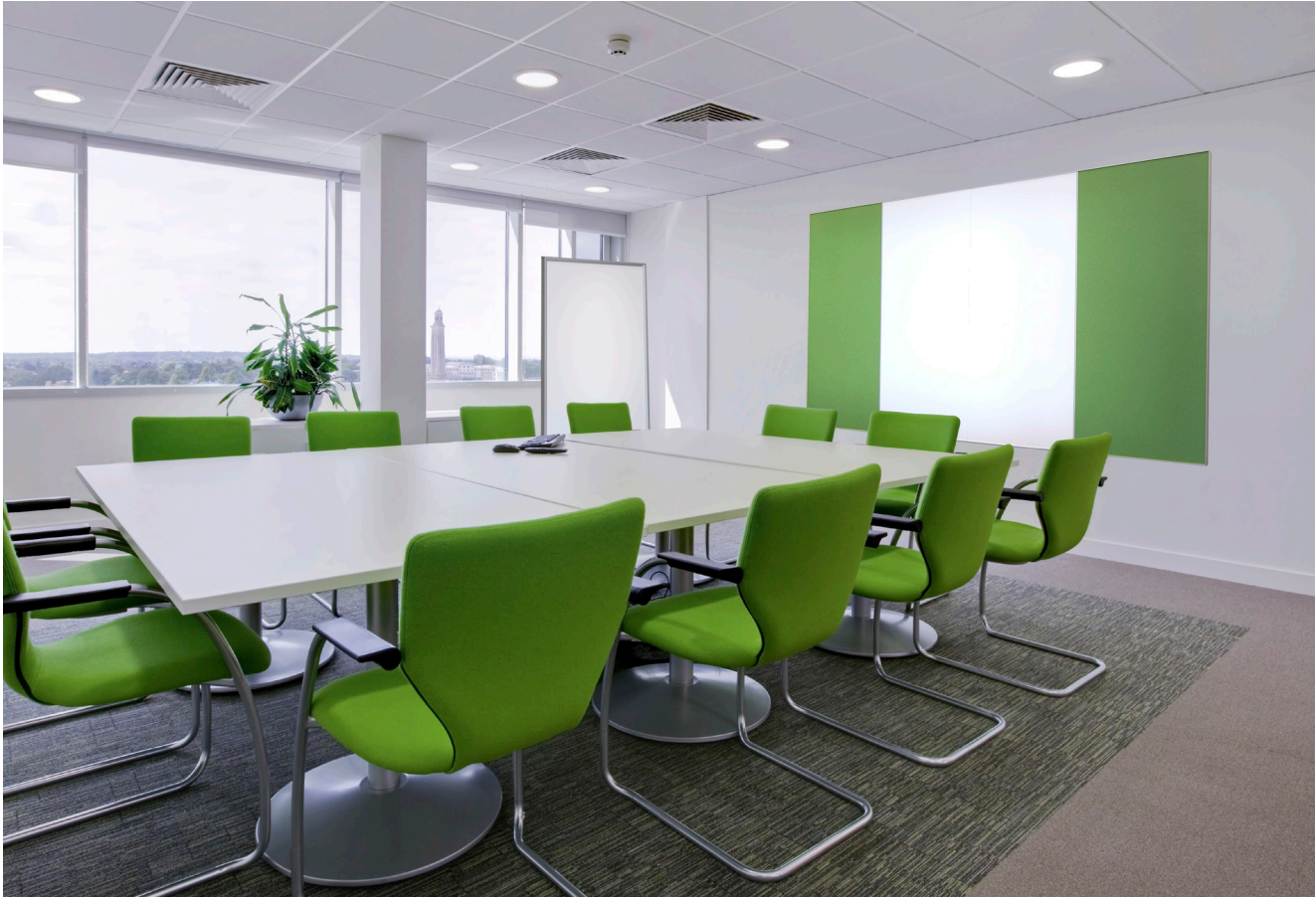
elements Series Combiboard integrated with tackable fabric.