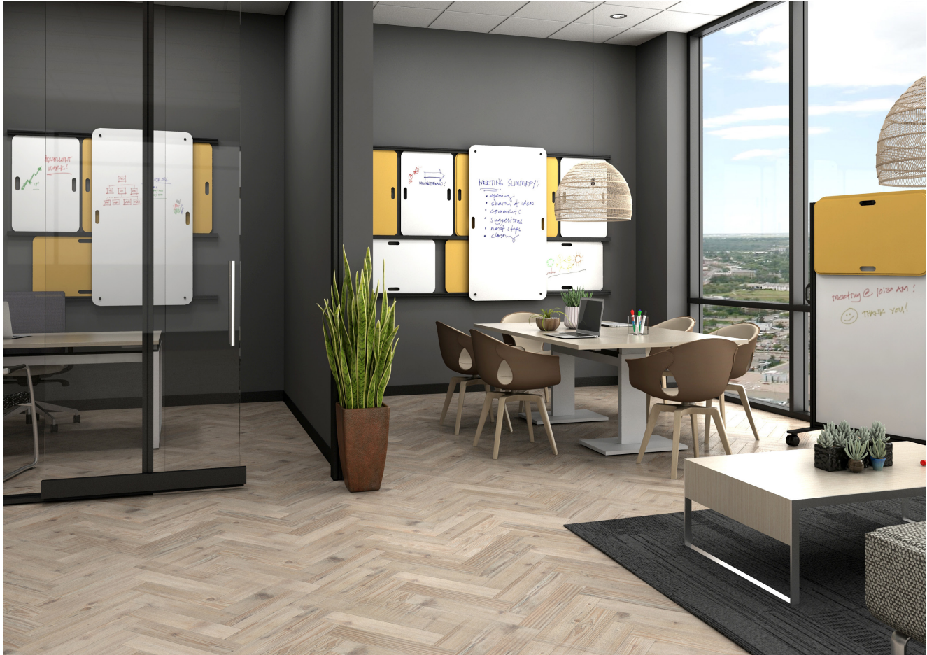
Merge Rail Frameless Reversible Sliding Panels in CPS Porcelain and Acousticor.