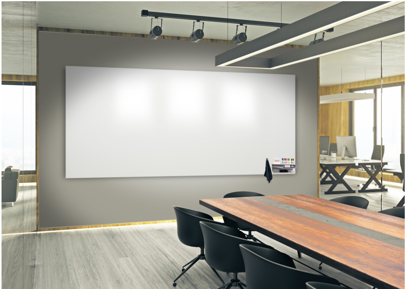
Merge Frameless Magnetic CPS Porcelain Markerboards. Available with Square or Knife Edge.