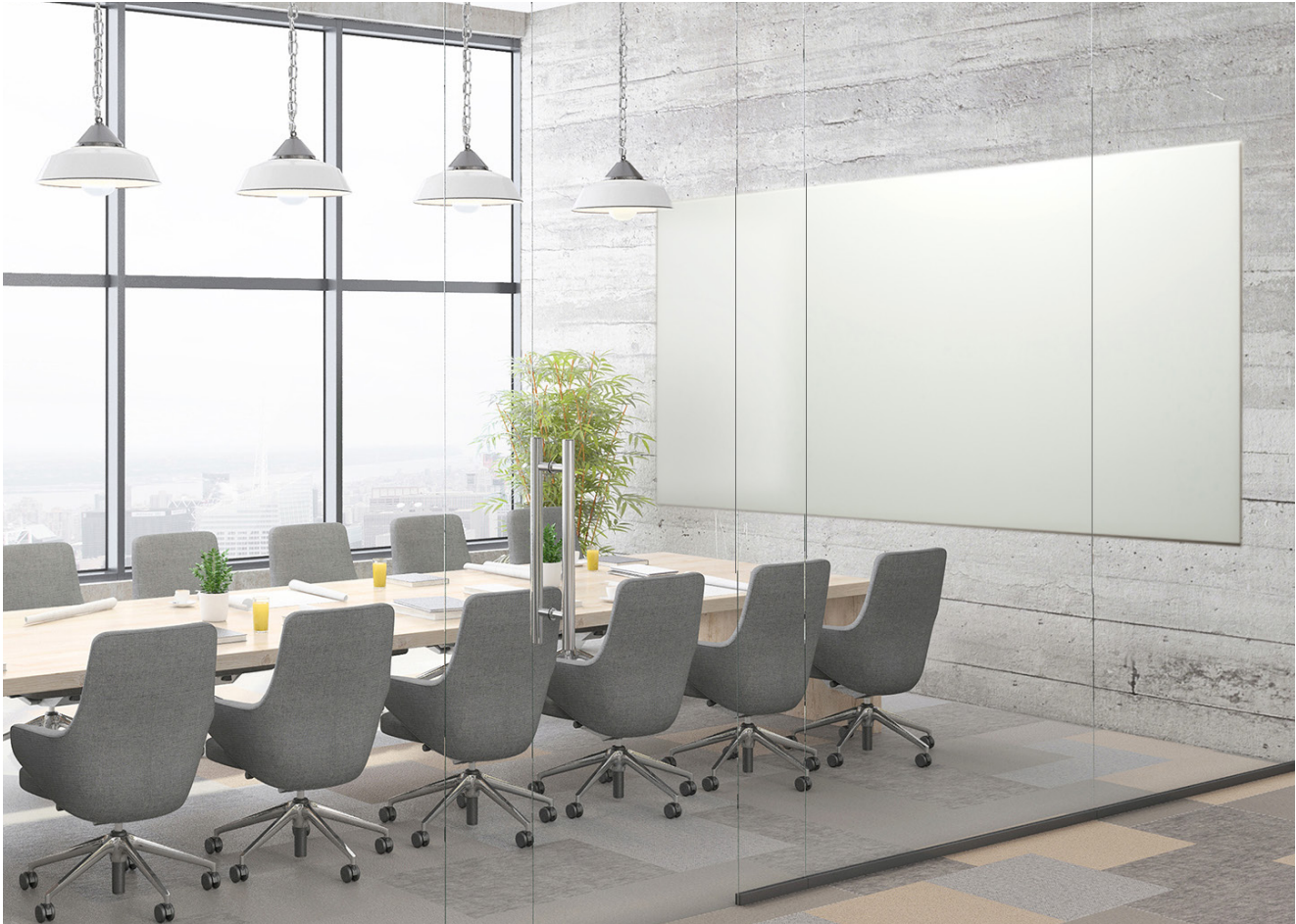
Frameless Glassboards in Satin non-glare glass.