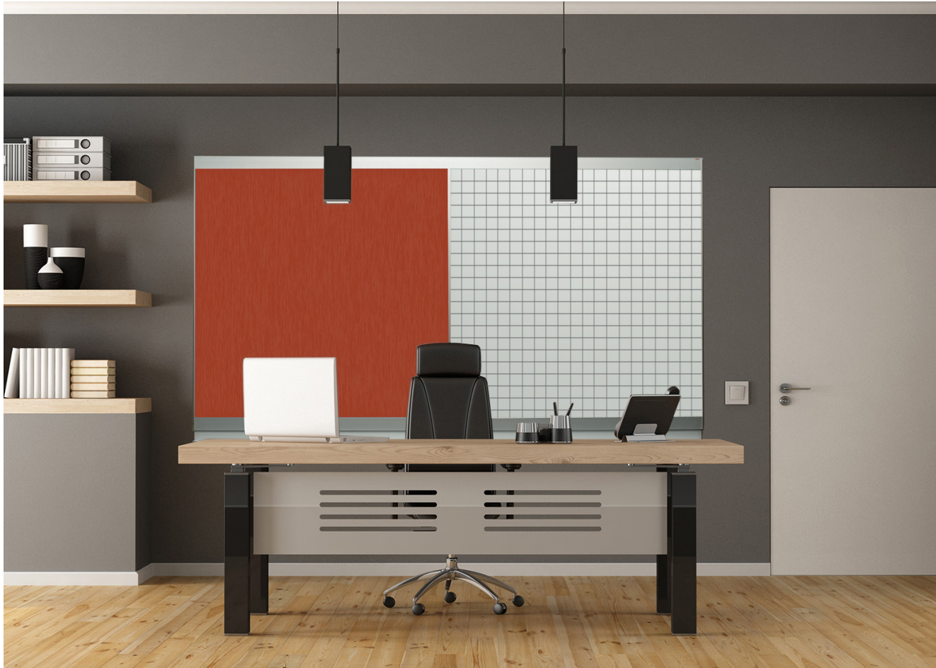
VIP Framed Glass Combiboard backpainted with Corona White Glass, printed graphic grid and tackable fabric.