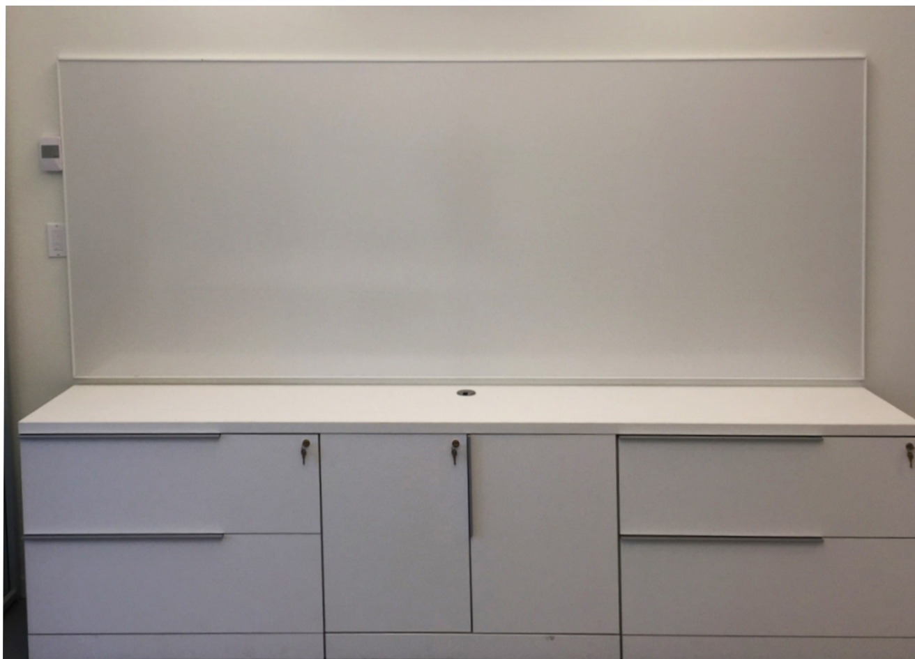
elements Series Custom Sized Porcelain Markerboards in white powder coat frame.