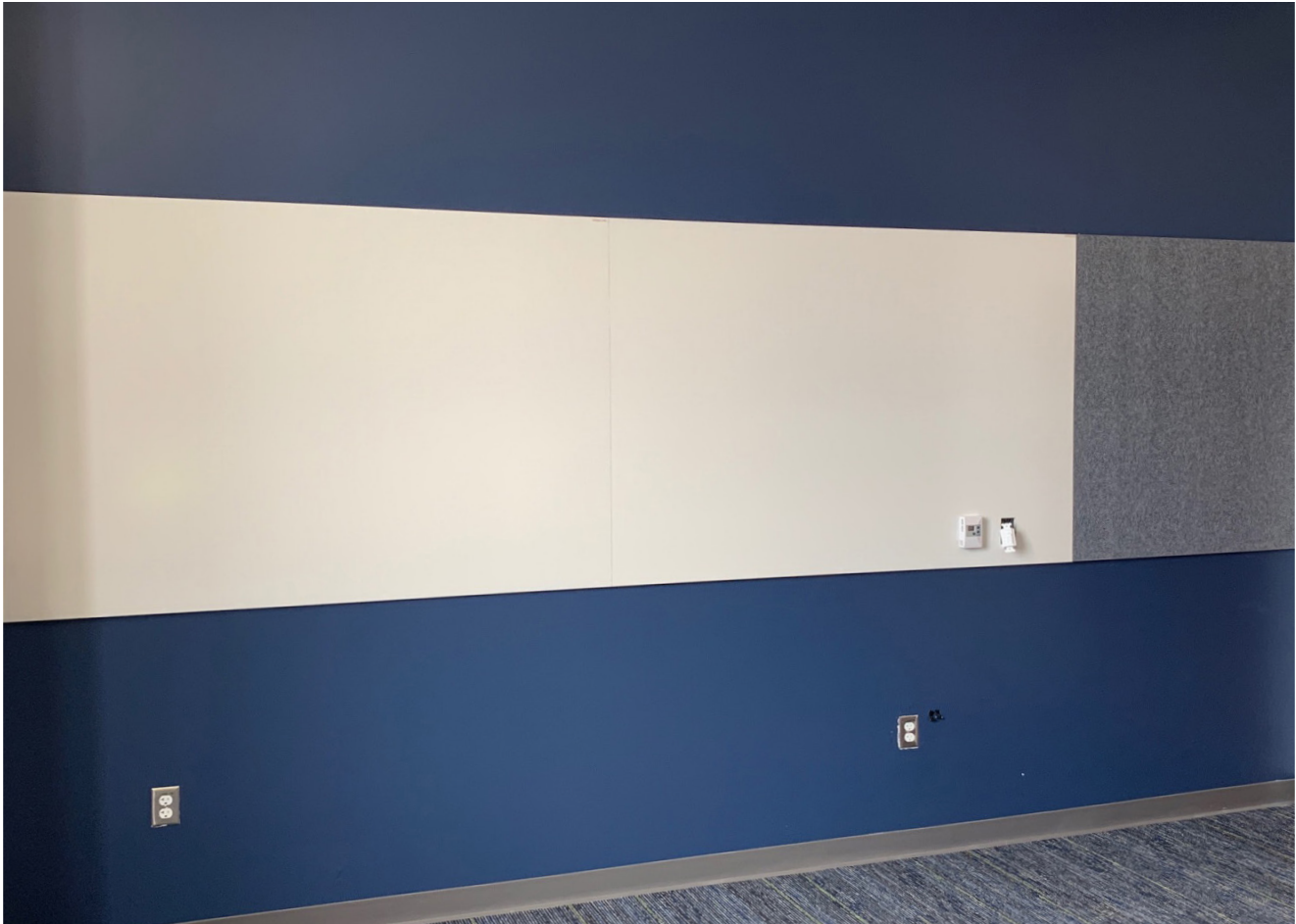
Merge Frameless Porcelain Combiboards, CPS Porcelain, spline joint and Acousticor panel.