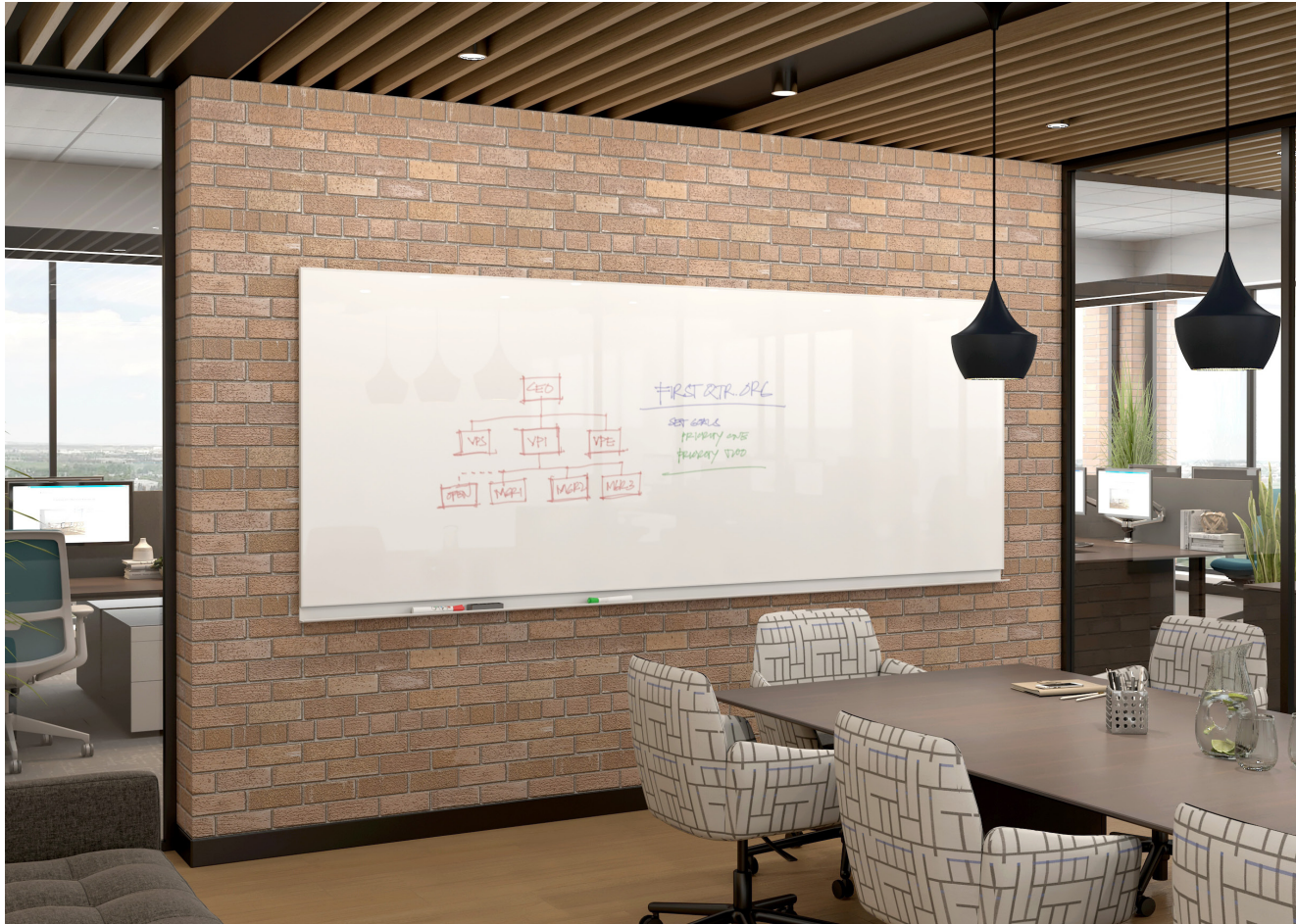
elements Series Glass Markerboards backpainted in Corona White with Full Length Integrated Penshelf.