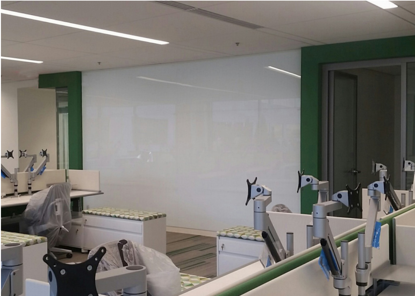
Frameless Magnetic Glass Markerboards backpainted with Corona White.