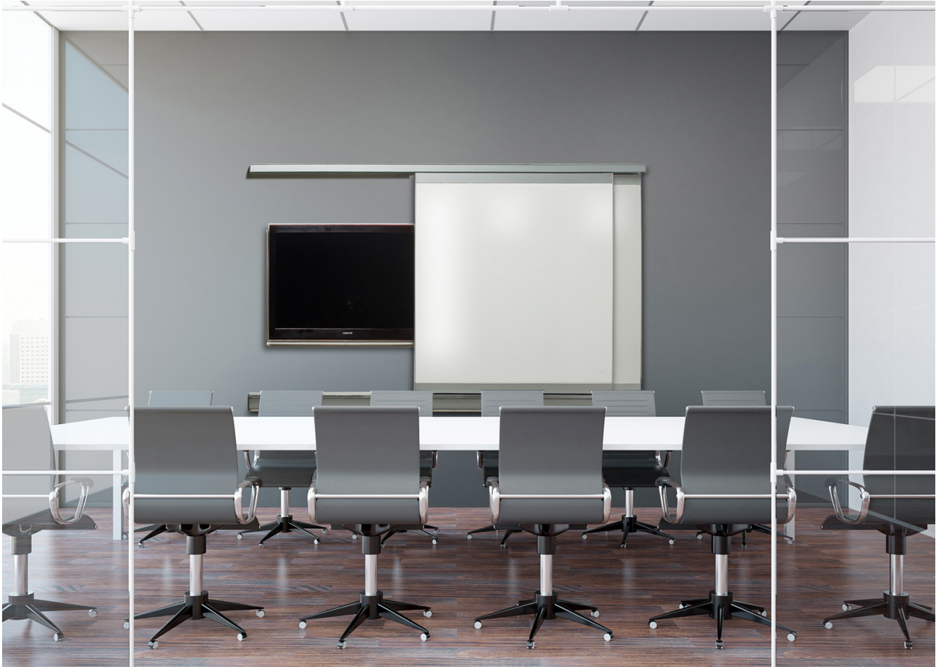
VIP+ Media Wall backpainted Corona White Glass Markerboards