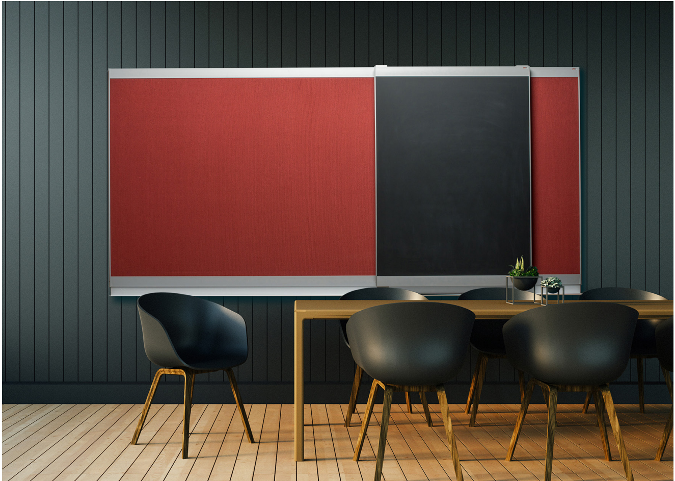
VIP Notice Board with Tackable Fabric shown with VIP Porcelain Chalk Component Boards.