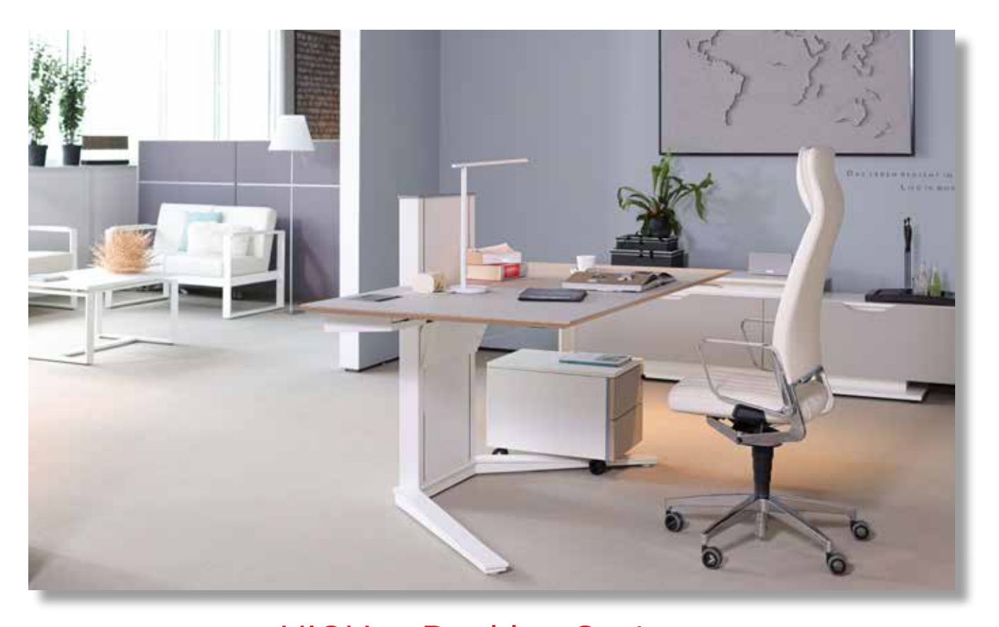
HIGHo1 Desking System