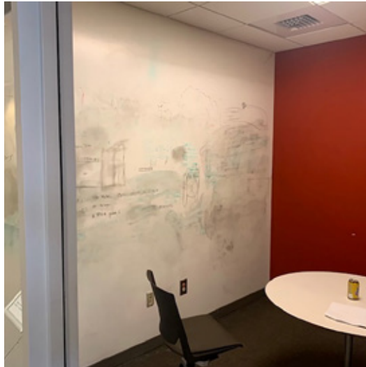
Non-Magnetic, Porous, Wall Applied Writing Surface with Limited Warranty

Are you still writing over the ghosts of words past? Then it's time to move on from wall applied writing surfaces.